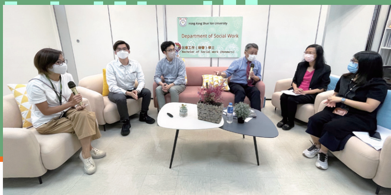
Round-table Discussion Session 圓桌討論環節